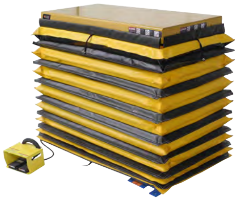
Accordian Skirt Guard (LT-ASG)*