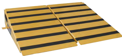
Loading Ramp (LT-LR)*